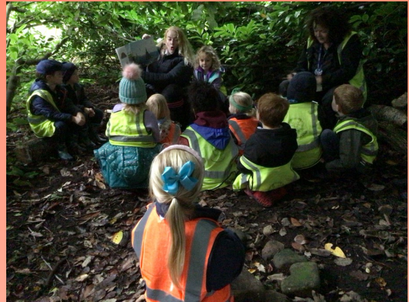
Stories in the woods.