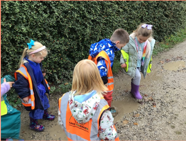
Mud glorious mud!!